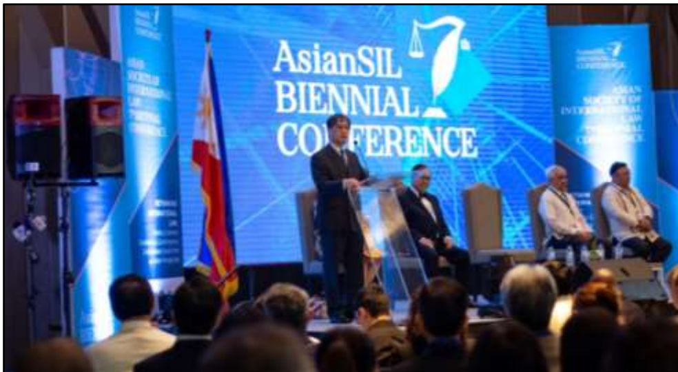
International Court of Justice Judge Iwasawa Yuji delivering the Keynote Address at the 7th Biennial Conference of the Asian Society of International Law (AsianSIL).