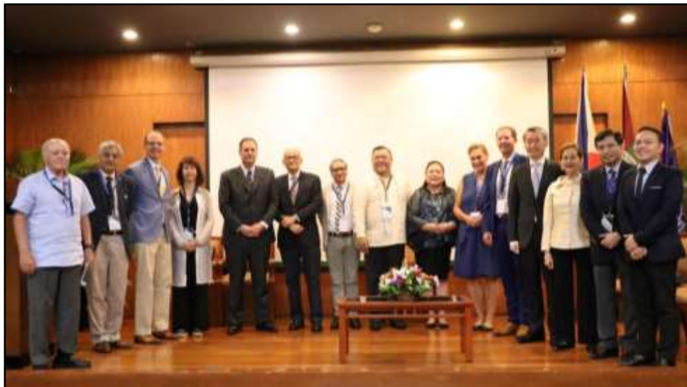
Junior Scholars Conference (“Rethinking International Law: Finding Common Solutions to Contemporary Civilizational Issues from an Asian Perspective”) that preceded the 7th Biennial Conference of the Asian Society of International Law.